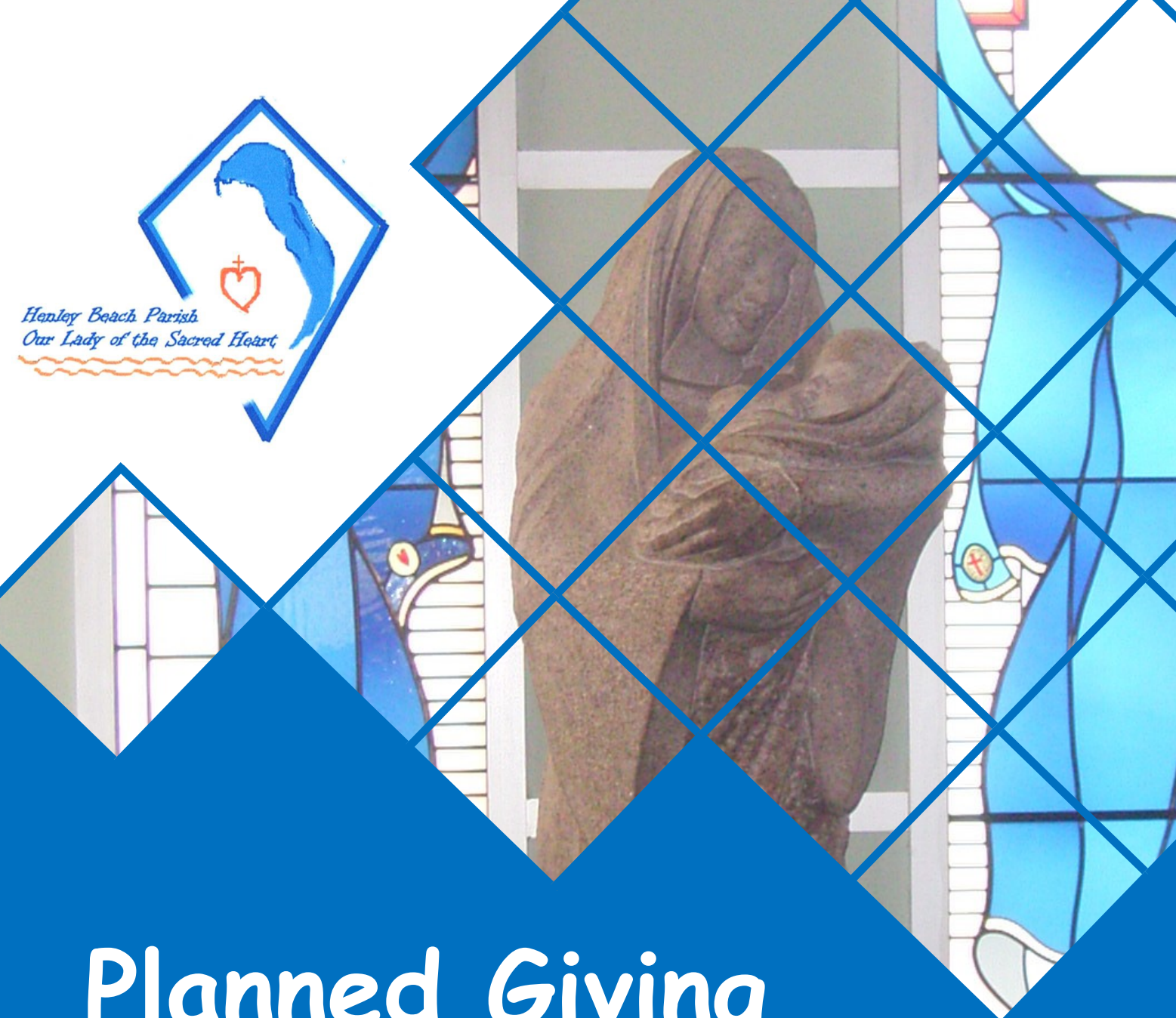
Henley Beach Parish Our Lady of the Sacred Heart

Forms are also available online, the parish office or the church at any time during the year.